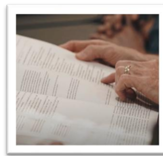
How to run Cor