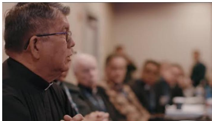
Christ-Centered Brotherhood (Cor Video 3:30 min)